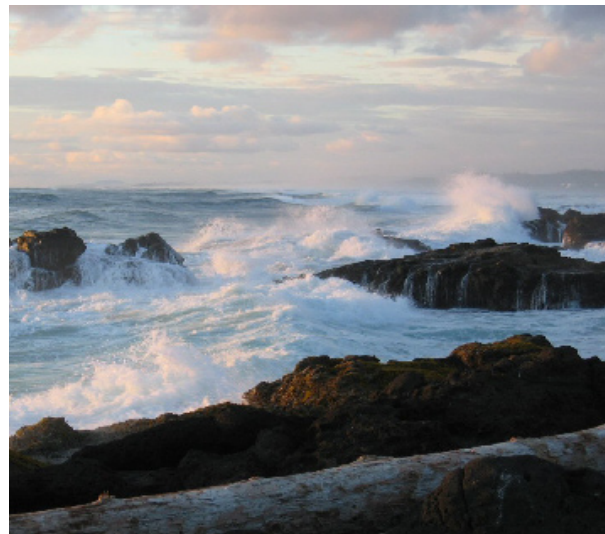
Ah, beauteous California... We could crush you, you know.

Hey! Retard fundies! Quit being retarded so that I don’t have to feel ashamed to call myself a Christian anymore.